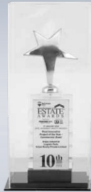
Remax India Estate 10th Annual Awards 2018 Most innovative project of the Year - Commercial (East)